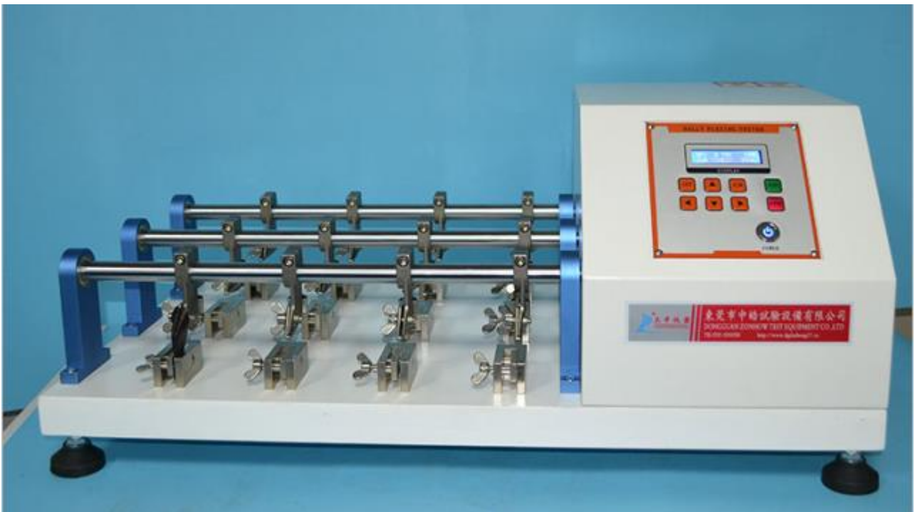
LCD control panel 0~999999, elegant appearance, quality assurance

Any interests, pls contact Jess as following Online contact way, easy and fast!