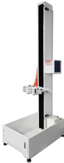
Model : SR-217 Free drop tester Max height : 1.5m / 2.0m