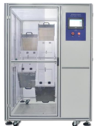
Model : SR-220A Tumble drop tester Protect cover + 0.5m + 1m