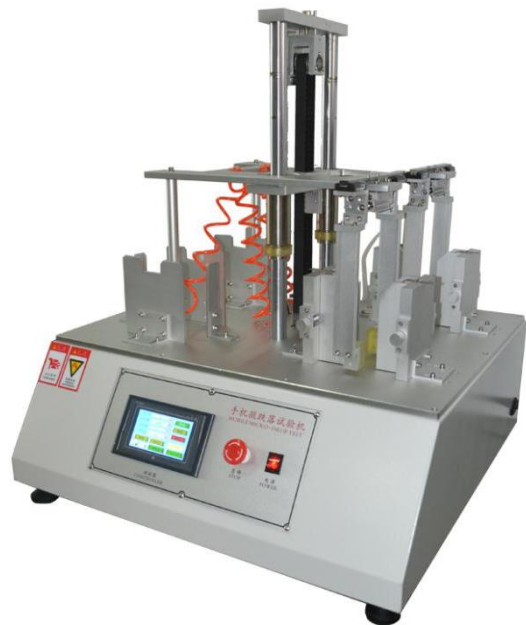
Double station : two absorb samples, two grip samples