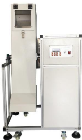
Model : SR-219A Tumble drop tester Max height : 1m