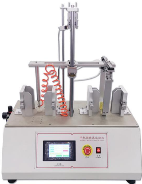
Single station : one absorb samples, one grip samples