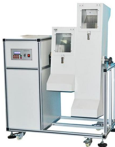
Model : SR-220 Tumble drop tester Max height : 0.5m+1m