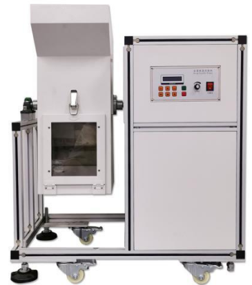
Model : SR-219 Tumble drop tester Max height : 0.5m