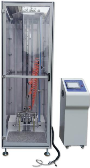
Model : SR-217A Directional drop tester 1.5m / 1.8m / 2.0m